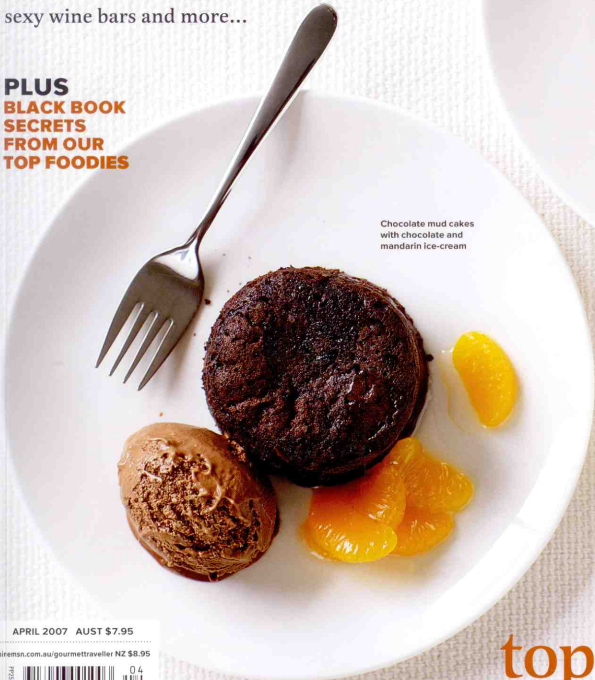
Chocolate mud cakes with chocolate and mandarin ice-cream

PLUS BLACK BOOK SECRETS FROM OUR TOP FOODIES