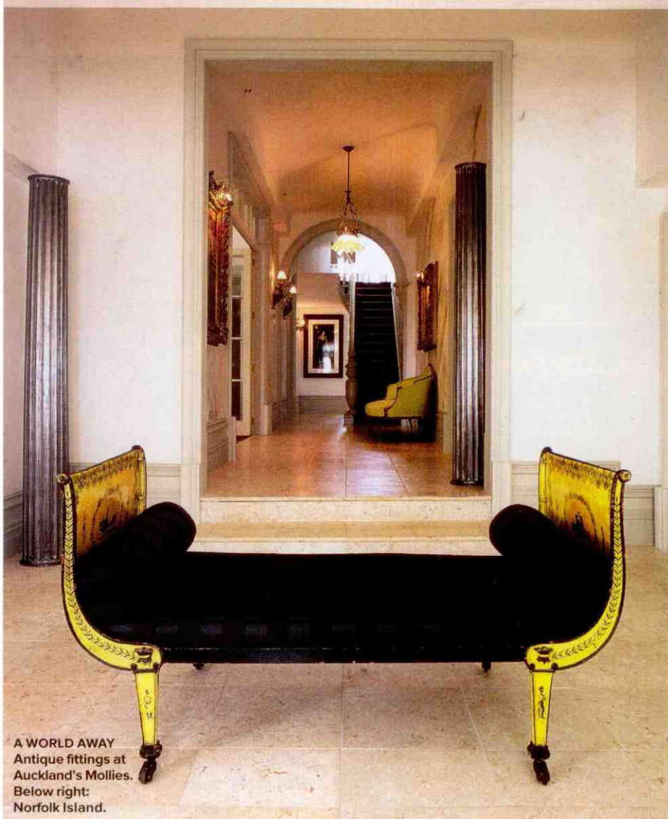
A WORLD AWAY Antique fittings at Auckland's Mollies. Below right: Norfolk Island.

Why? Who needs to fly when 'Bali' is just a short drive from Melbourne? Picture you and that special someone, barefoot in your Balinese hideaway, with your own chef on a pavilion on your own lake. It's Bali, Jim, but not as we know it. In fact, this exotic getaway lies in the foothills of Victoria's Dandenong Ranges. Balinese Retreat is proving a great summer destination for couples who prefer not to battle for the buffet with hordes of other guests (you'll have the retreat all to yourself). With a mid-week Exotic Romance offer of $799 per couple, including one night's accommodation, a banquet and a massage for each person, you can have that 'Bali' break without leaving the country. For bookings, call (03) 9737 0413. www.balineseretreat.com.au.